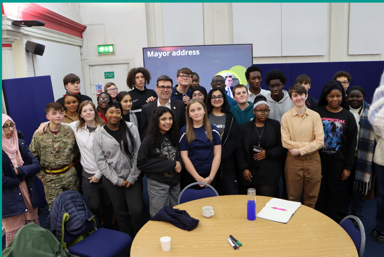
Members of the GMYCA 2022-2024 cohort alongside Mayor Andy Burnham during their December 2023 meeting, when this report was requested.

We wish to thank Mayor of Greater Manchester Andy Burnham, who has repeatedly given us his support and backing. His whole hearted dedication to our group as well as the city is not something we take for granted so we'd also like to give a massive thank you to him.