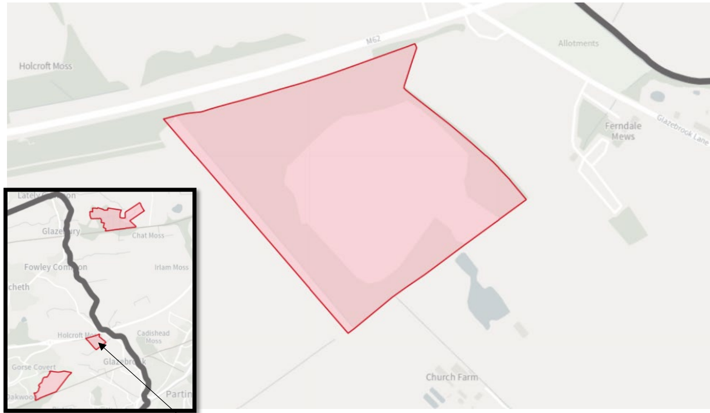
Map 1: Holcroft Moss within the Manchester Mosses Special Area of Conservation (SAC)