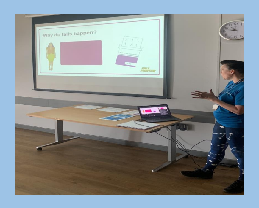
Floor based backward chaining and ROSPA falls fighter training